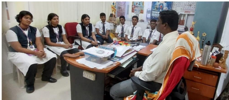
Principal conducted meeting for the toppers today

#22 Muthukumaran Nagar, Poonamallee, Chennai - 56