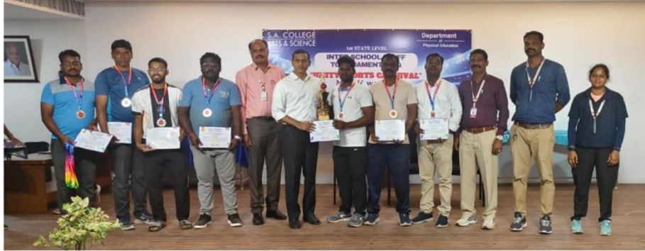
Our school won runners trophy in Men's tennis ball cricket tournament organised at S.A College of Arts and Science on January 5 & 6 2025

#22 Muthukumaran Nagar, Poonamallee, Chennai - 56