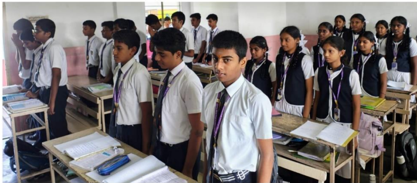
On Martyrs' Day, a two-minute silence was observed at 11 AM to honor Mahatma Gandhi and his contributions to the nation

#22 Muthukumaran Nagar, Poonamallee, Chennai - 56