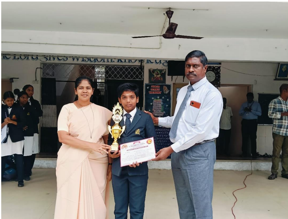
✚ Our School Male staffs were went and participated in Cricket match conducted by SA College and they won Runner Trophy.