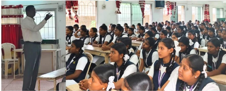
Principal conducted Motivational meeting for the Students of Class IX

#22 Muthukumaran Nagar, Poonamallee, Chennai - 56